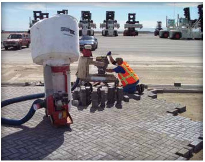
Figure 8. Saw cutting pavers.