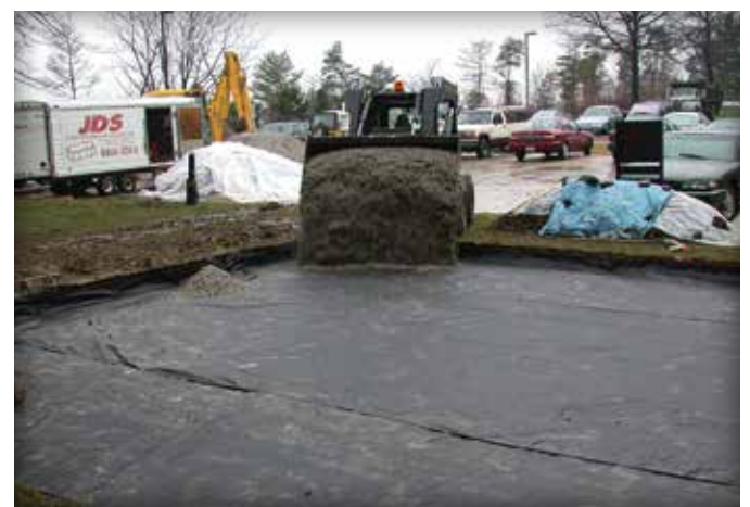
Figure 3. Application of the geotextile under aggregate base.