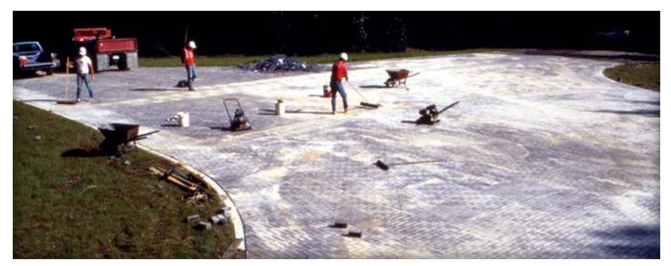
Figure 12. Excess sand swept from the finished surface will make the pavement ready for traffic.

Dry joint sand is swept into the joints and the pavers compacted again until the joints are full. See Figures 10 and 11. This may require two or three passes of the plate compactor. If the sand is wet, it should be spread to dry on the pavers before being swept and compacted into the joints. Joint sand may be finer than the bedding sand to facilitate filling of the joints. Bedding sand also can be used to fill the joints, but it may require extra effort in sweeping and compacting. Compaction should be within 6 ft (2 m) of an unrestrained edge or laying face. All pavers within 6 ft (2 m) of the laying face should have the joints filled and be compacted at the end of each day. Excess sand is then removed. See Figure 12. The remaining uncompacted edge can be covered with a waterproof covering if there is a threat of rain. This will prevent saturation of the bedding sand, minimizing removal and replacement of the bedding sand and pavers.