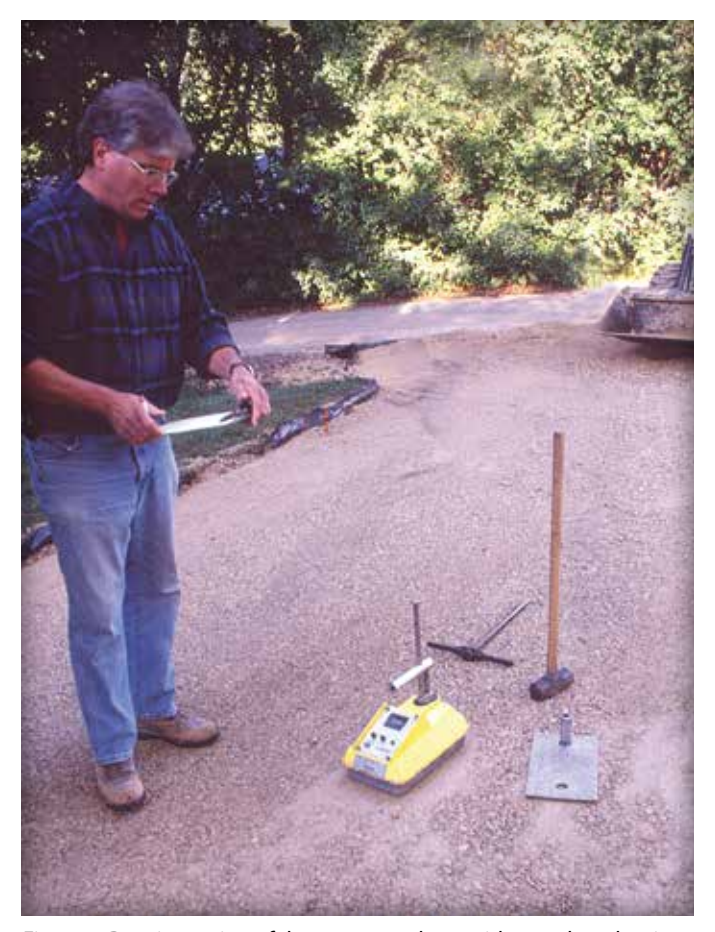
Figure 5. Density testing of the aggregate base with a nuclear density gauge.

Many localities determine base thickness with the 1993 Guide for the Design of Pavement Structures published by the American Association of State Highway and Transportation Officials (AASHTO). The AASHTO procedure calculates the structural number (SN) of the strength coefficients of each base and pavement layer. The SN is