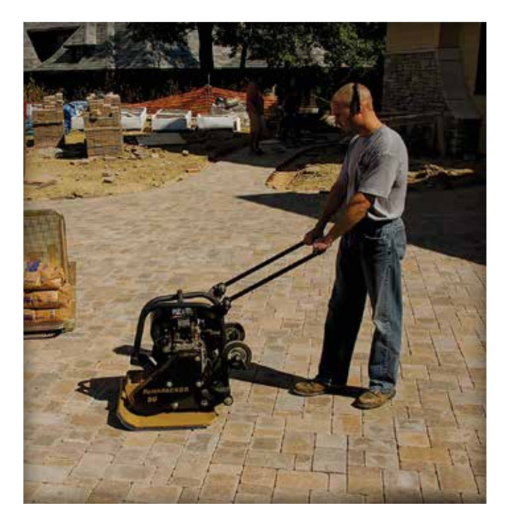
Figure 9. Compacting the pavers and bedding sand.

catch basins. These areas should be covered with a geotextile fabric to prevent loss of the bedding sand.