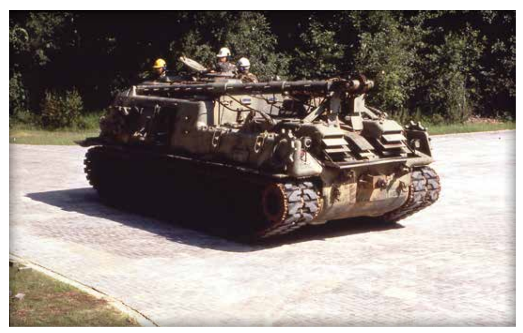
Figure 13. The completed paved area from Figure 12 receives tank traffic at the U.S. Army Proving Grounds in Aberdeen, Maryland.

Final surface elevations should not vary more than \pm^{3}/8 in. ( \pm 10 mm) under a 10 ft (3 m) straightedge, unless otherwise specified. Bond or joint lines should not vary \pm^{1}/_{2} in. (13 mm) over 50 ft (15 m) from taut string lines. The top of the pavers should be ^{1}/_{8} to ^{3}/_{8} in. (3 to 10 mm) above adjacent catch basins, utility covers, or drain channels, with the exception of areas required to meet ADA design guideline tolerances. The top of the installed pavers may be ^{1}/_{8} to ^{1}/_{4} in. (3 to 6 mm) above the final elevations to compensate for possible minor settling. A small amount of settling is typical of all flexible pavements. Optional sealers or joint sand stabilizers may be applied. Using stabilized sand may have advantages in areas prone to joint sand loss. See ICPI Tech Spec 5–Cleaning, Sealing and Joint Sand Stabilization of Interlocking Concrete Pavement for further guidance.