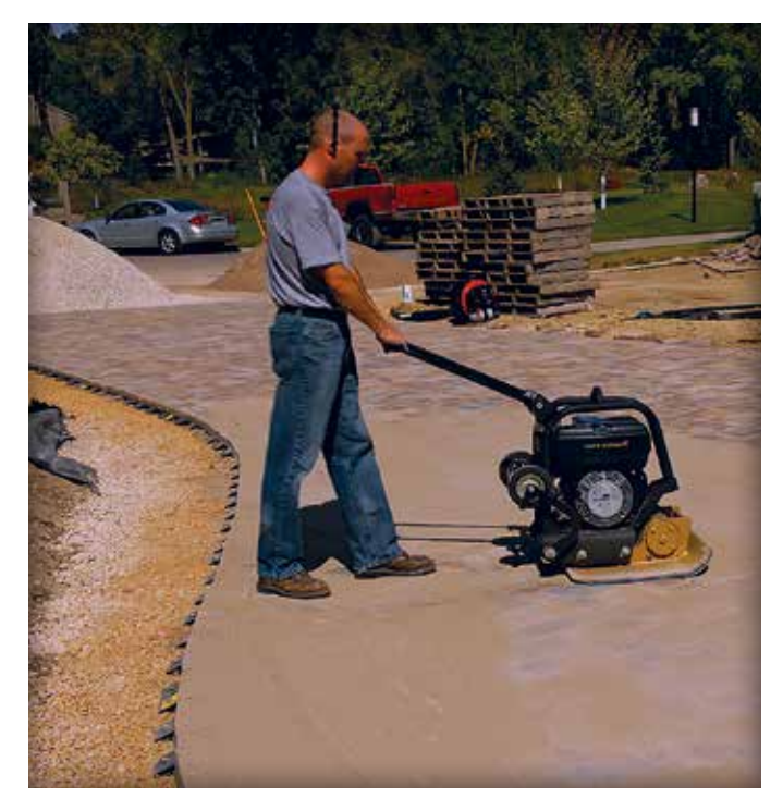
Figure 11. Vibrating sand into the joints.

performance. Certain manufacturers may have materials and data that discuss the potential benefits of shapes on functional and structural performance in vehicular applications. Chalk lines snapped on the bedding sand or string lines pulled across the surface of the pavers are used as a guide to maintain straight joint lines. Buildings, concrete collars, inlets, etc., are generally not straight and should not be used for establishing straight joint lines.