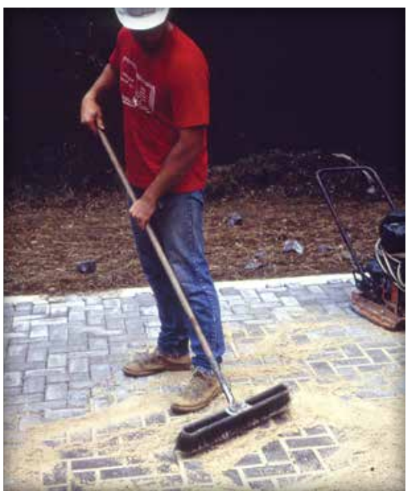
Figure 10. Spreading and sweeping joint sand.

Bedding sand under concrete pavers should conform to ASTM C33 or CSA A23.1. This material is often called concrete sand. Masonry sand for mortar should never be used for bedding, nor should limestone screenings or stone dust. The bedding sand should have symmetrical particles, generally sharp, washed, with no foreign material. Waste screenings and stone dust should not be used, as they often do not compact uniformly and can inhibit lateral drainage of moisture in the bedding layer. ICPI Tech Spec 17—Bedding Sand Selection for Interlock -