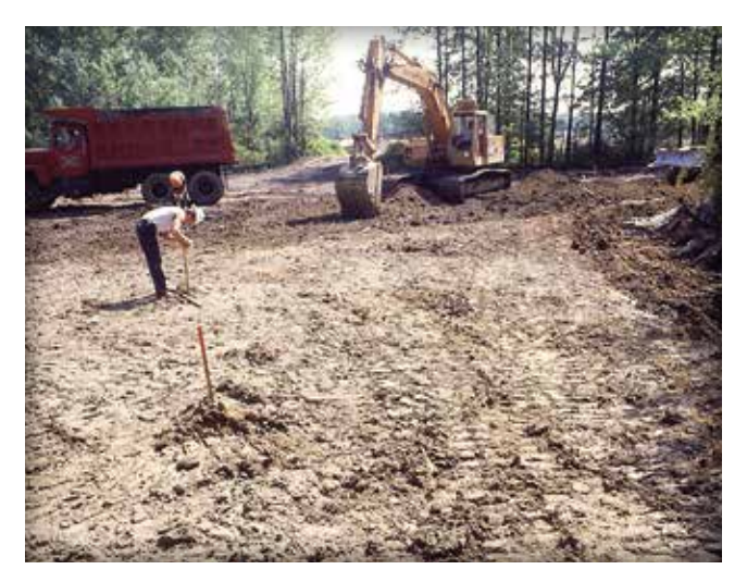
Figure 1. Excavation of the soil subgrade and placing grade stakes.

Installation steps include job planning, layout, excavating and compacting the soil subgrade, applying geotextiles (optional), spreading and compacting the sub-base and/or base aggregates, constructing edge restraints, placing and screeding the bedding sand, and placing concrete pavers. For larger installations mechanical placement of pavers may be more economical. Refer to Tech Spec 11–Mechanical Installation of Interlocking Concrete Pavements for additional information.