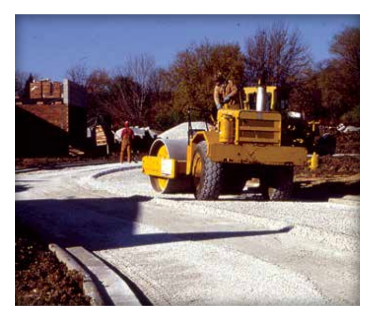
Figure 4. Base compaction with a vibratory roller.

When the fabric is placed in the excavated area, it should be turned up along the sides of the opening, covering the sides of the base layer. There should be no wrinkles on the bottom. When the aggregate is dumped on the fabric, the tires from trucks should be kept off the fabric to prevent wrinkling.