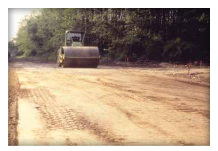
Figure 2. Compacting the soil subgrade.